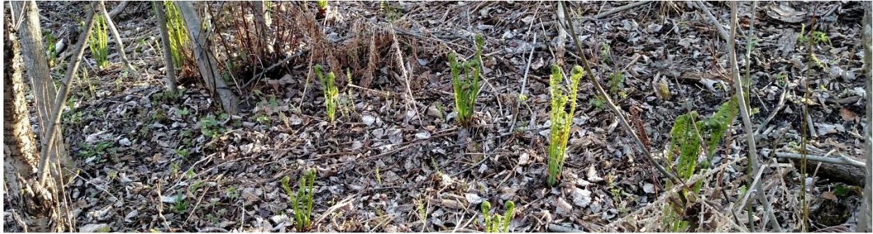
Figure 1. Ostrich ferns unfurling in a forest understory. Photograph 6:13 pm, May 9, 2017 by Kyle G Gill.